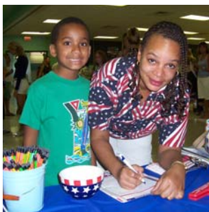
Voter registration during Jensen Beach Elementary School open house