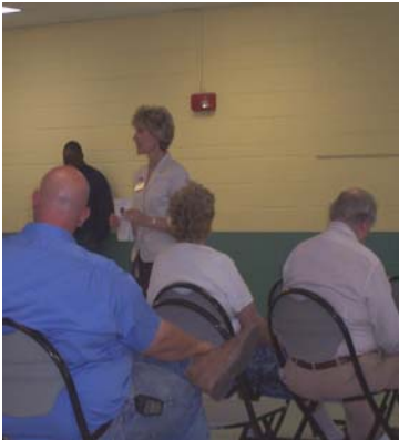
Supervisor of Elections answers questions at the NAACP Home Fest event